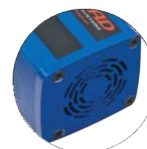
Integrated Fan Kit