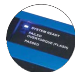
LED lights located on both sides